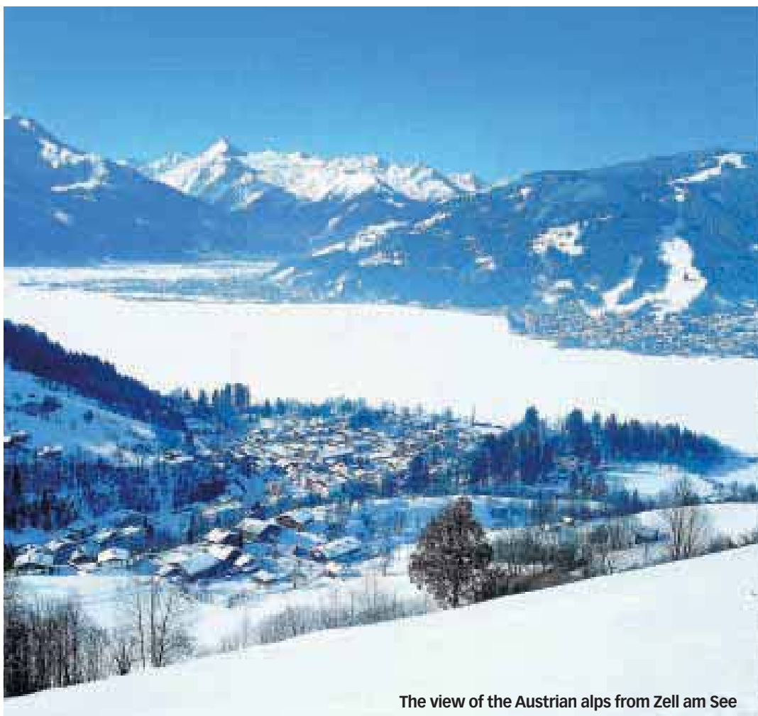
The view of the Austrian alps from Zell am See